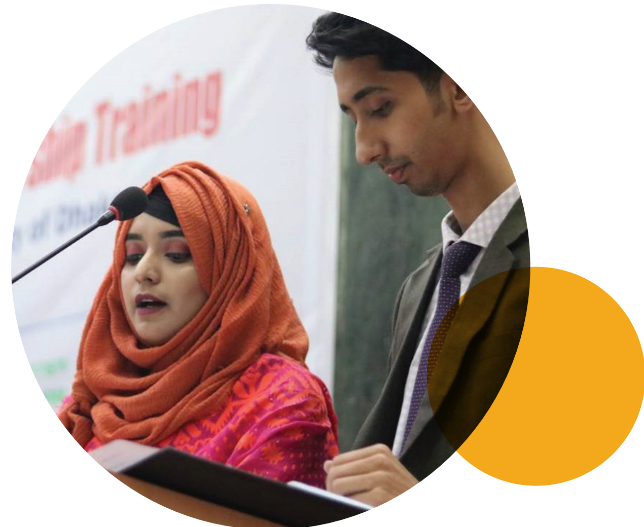
Above: Image courtesy of Rupantar

The influence of faith-based leaders could be leveraged to debunk interpretations of religious texts that seek to legitimise violence and discrimination.