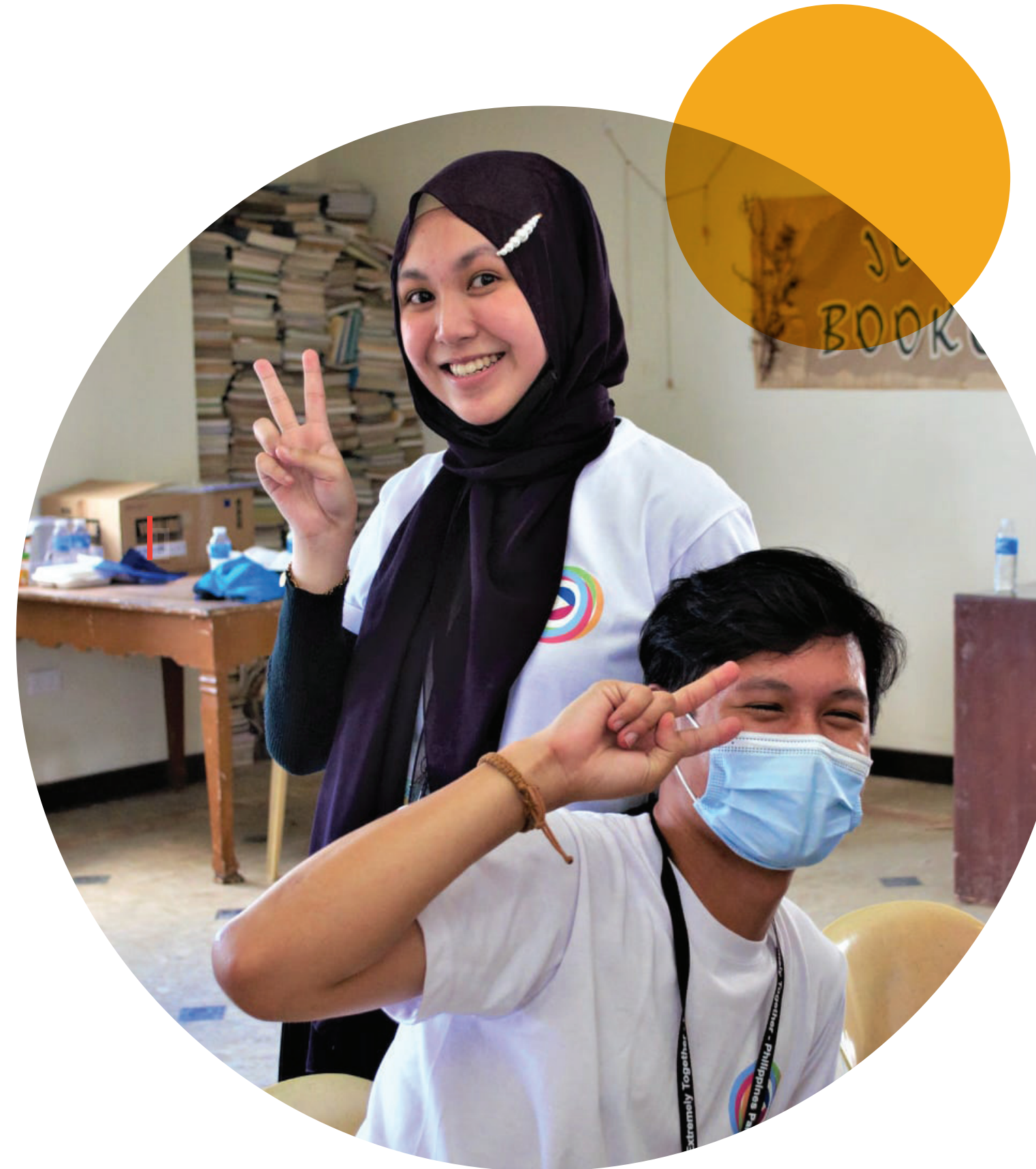
Above: Image courtesy of Extremely Together Philippines

Additionally, the Philippines and Bangladesh research found that role models play an important role in young peoples' decision-making and behaviour. Role models can use this influence to encourage youth participation and foster a sense of belonging. Furthermore, the family can be an important support system to allow young people to build confidence and learn alternative narratives. Participation in a family unit can encourage and be an example for young people to participate in their wider communities.